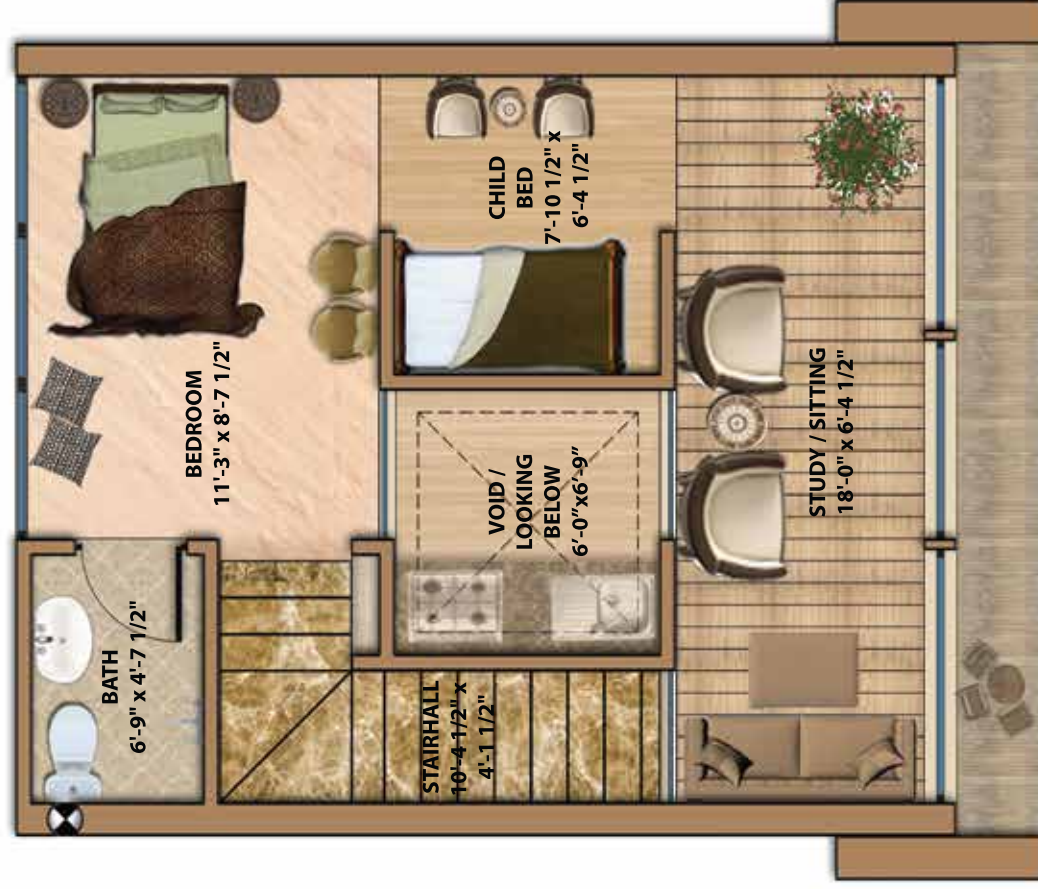
C-2 FIRST FLOOR